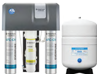
Everpure RO-200U Reverse Osmosis System

Efficient and flexible with blending for different food service applications